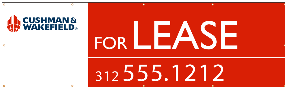
3' x 10' Typical Horizontal Banner