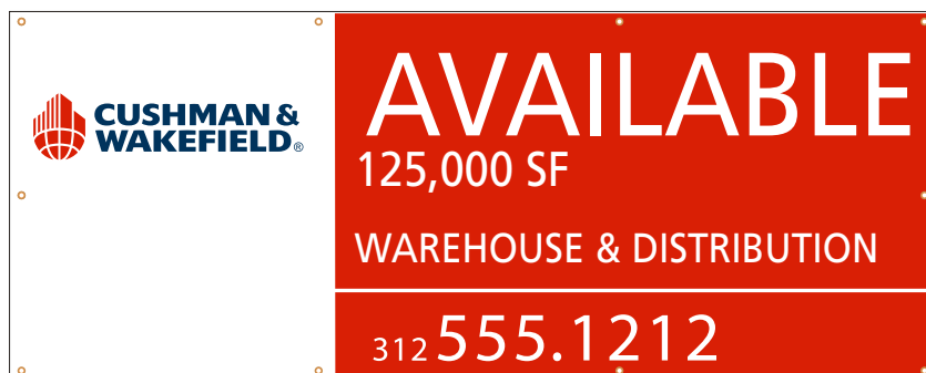
Custom 4' x 10' Horizontal Banner